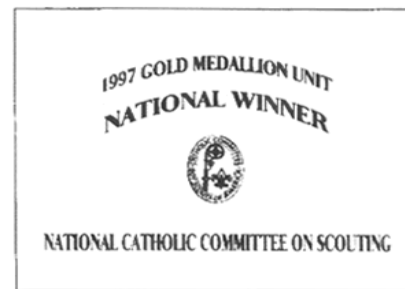
National Winner Flag

An 11" x 14" Certificate commemorating the presentation of the National Gold Medallion Unit Award