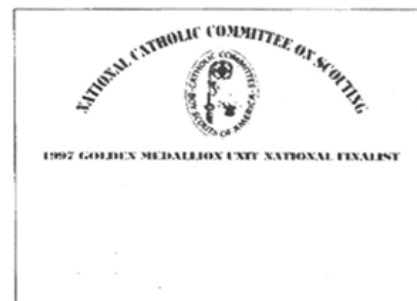
National Finalist Certificate

A 3' x 5' Unit Flag for each National Gold Medallion Winner