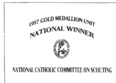
National Winner Flag

An 11" x 17" Certificate commemorating the presentation of the National Gold Medallion Unit Award