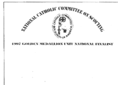
National Finalist Certificate

A 3' x 5' Unit Flag for each National Gold Medallion Winner